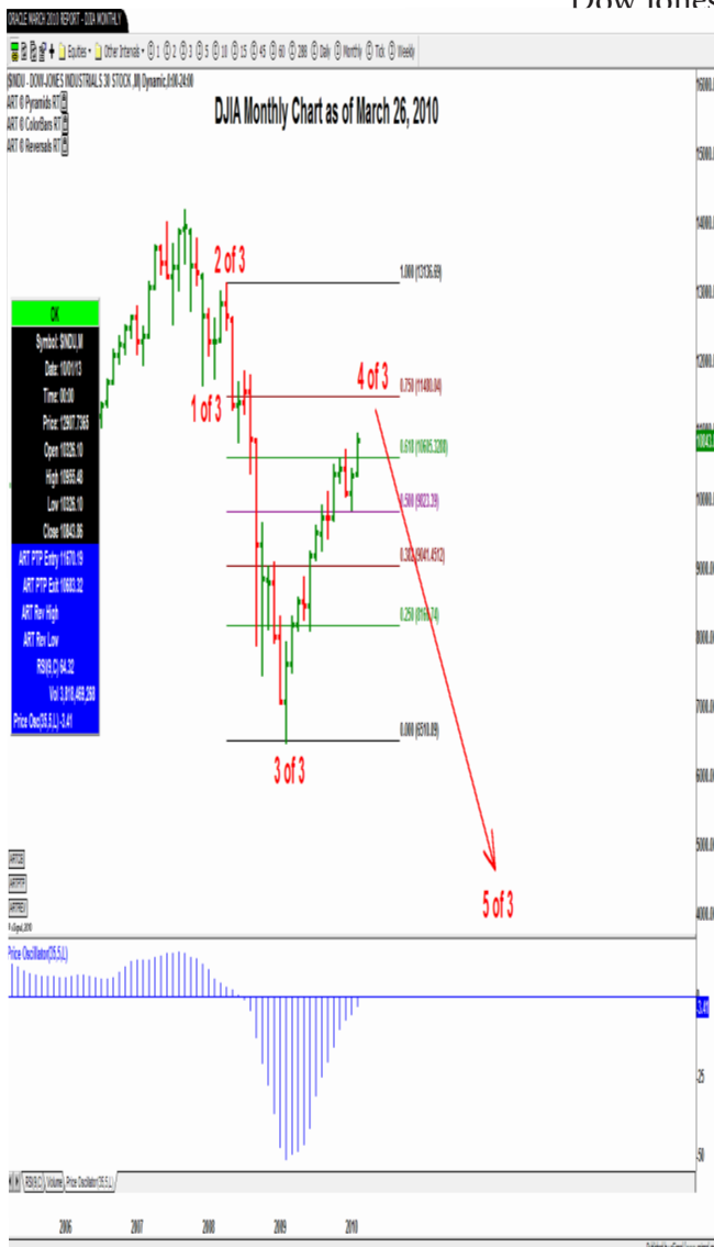
Dow Jones Monthly Chart

monthly chart was shown, but instead of the price oscillator at the bottom of the chart it was replaced with an RSI indicator. Mr. McDowell indicated that when the RSI pierces the lower band or red line in the chart there is a high probability that the final low was not in place yet and that the bearish impulse trend of the market is not over. This also indicates that we are in a bear market of great significance.